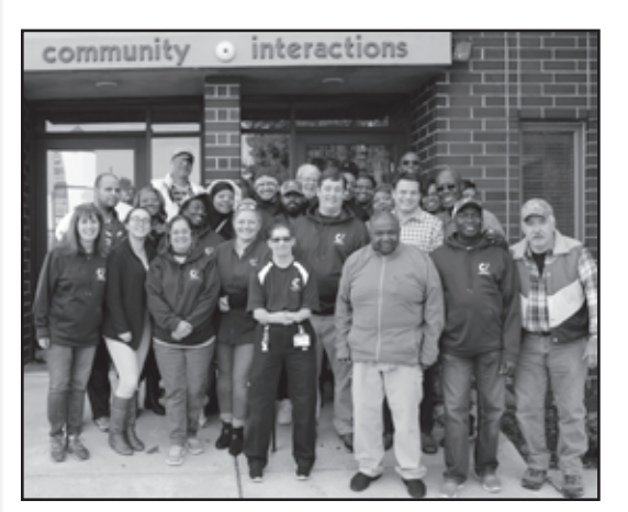
On October 25th, CI held its annual Health and Safety Day. CI family members gathered for a group shot outside the Swarthmore headquarters. The day-long event presented a variety of events to promote healthy lifestyles.